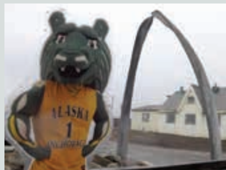
Traveling Spirit visited the whalebone arch in Barrow. Now you can decide where he'll go next!