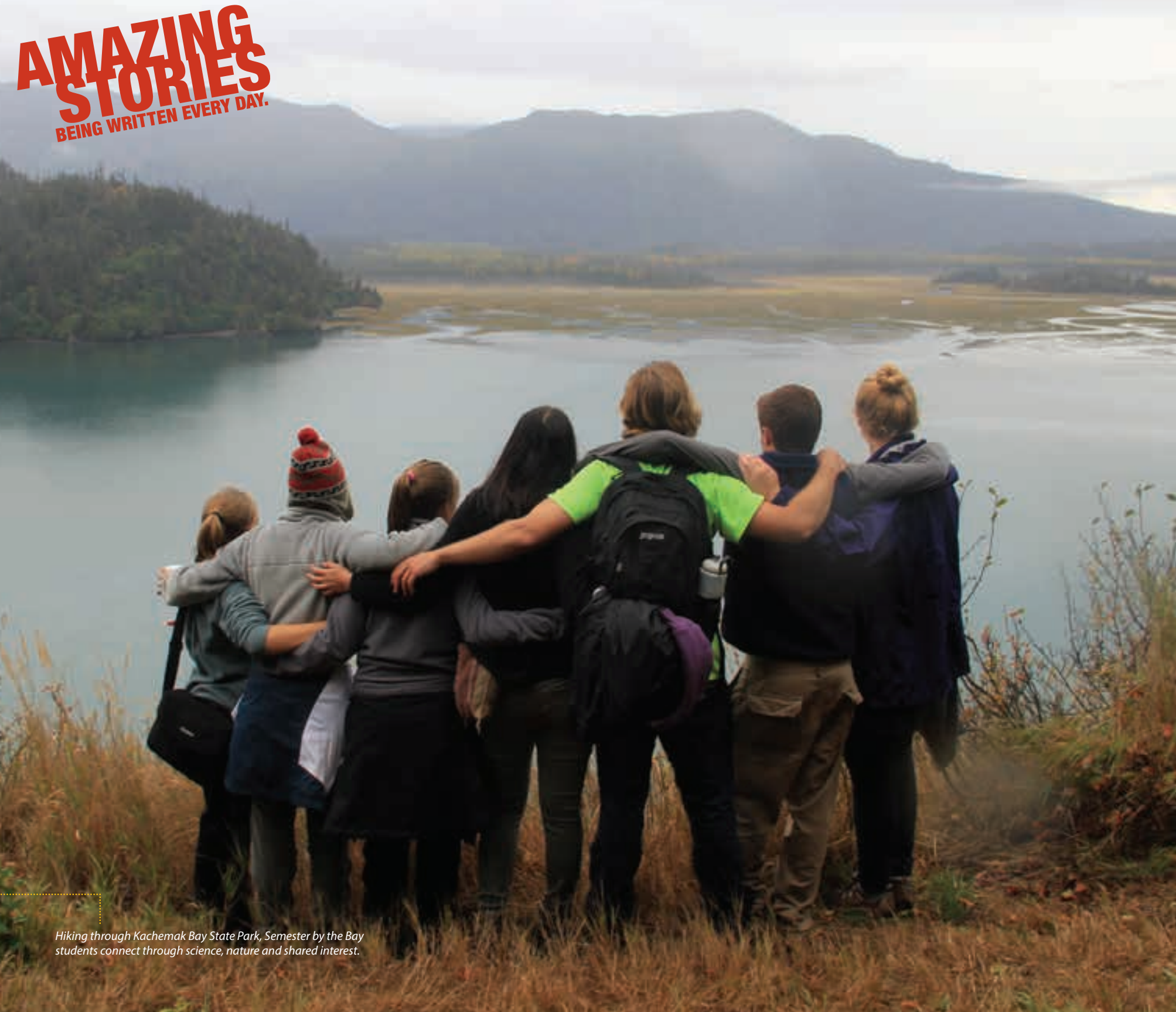
Hiking through Kachemak Bay State Park, Semester by the Bay students connect through science, nature and shared interest.