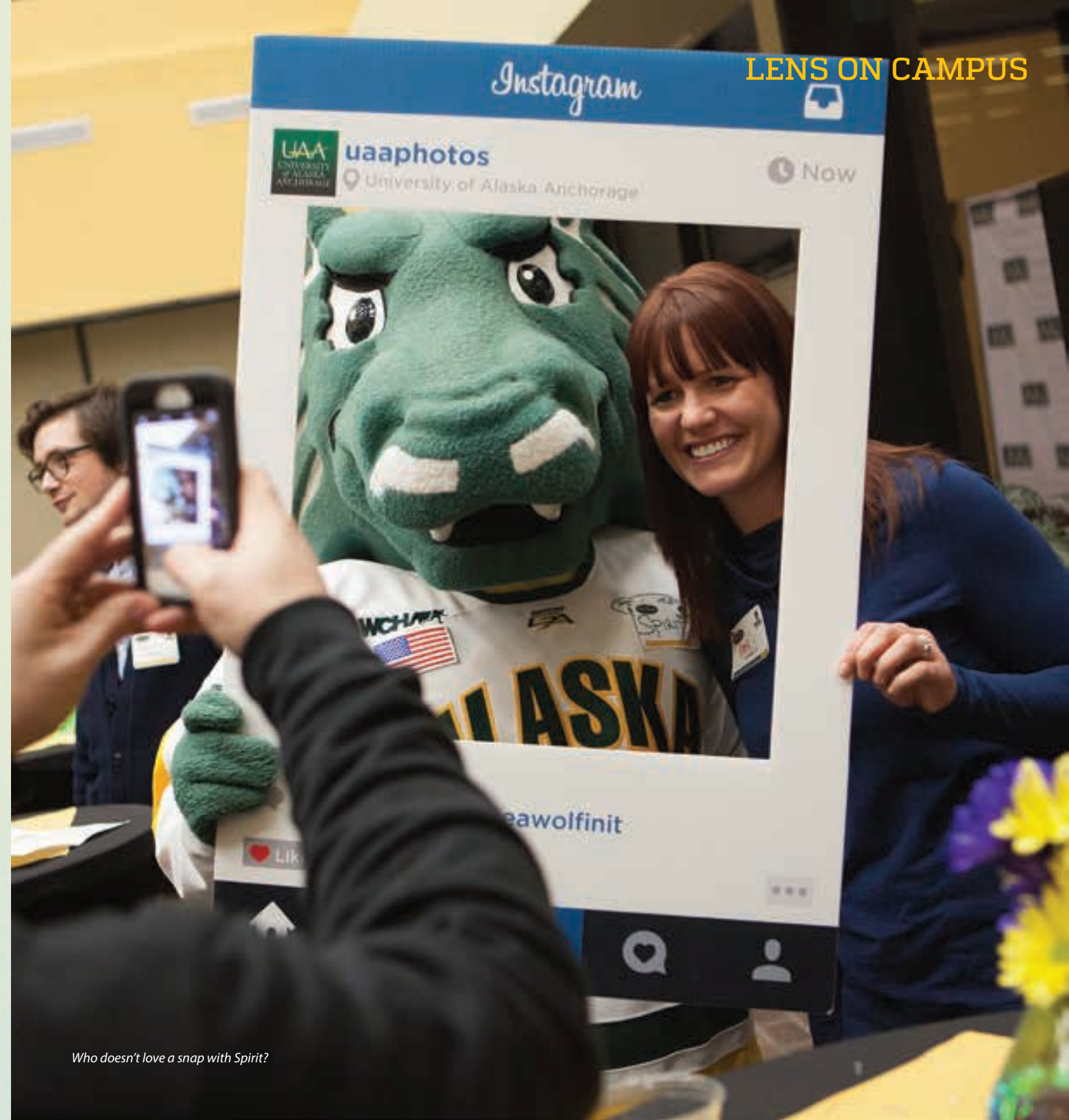
Who doesn't love a snap with Spirit?

The online magazine can be found here: tinyurl.com/AlumniSpirit .