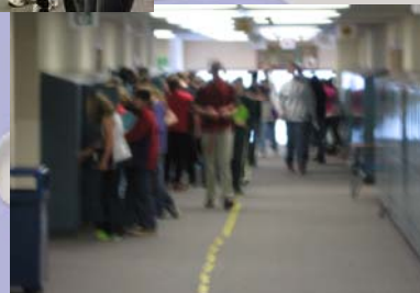
Sticking to the right – part of the Hallway Challenge