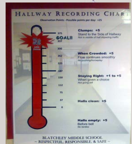
Feedback poster for the Hallway Challenge

...by the creation and maintenance of a leadership team consisting of members from every grade level and scheduled bi-monthly meetings with published agendas and notes on a wiki site available for all staff to look at.