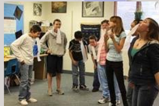
Husky Pack team competitions

Looking at the data of office referrals, antidotal feedback from staff and students, the participation rates of staff and students in the ongoing "token" recognitions, and the successful outcomes of PBS challenge opportunities has been a strong indicator of PBS becoming systemic at Blatchley.