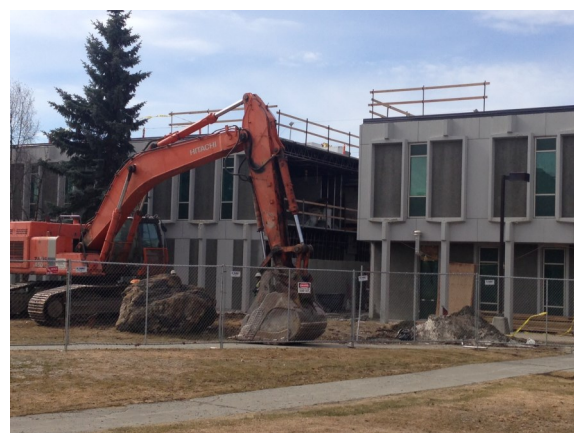
The “Slice of Light” is going into the BMH