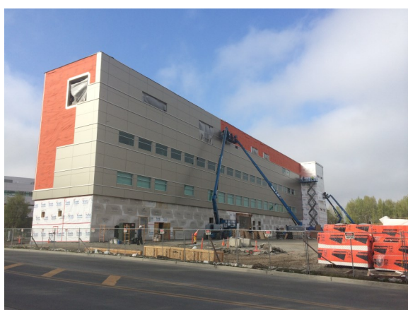
Engineering & Industry Building