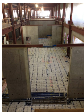
Engineering & Industry Building construction is underway