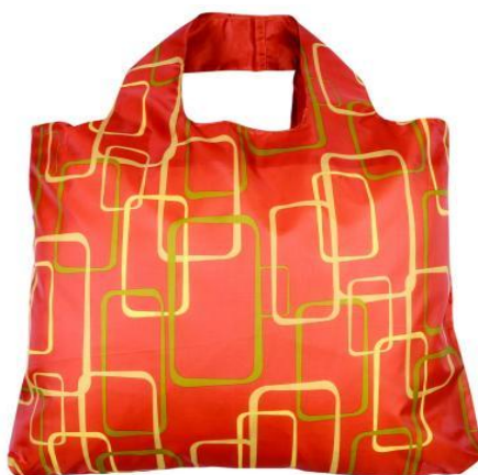
Envirosax from Enviros