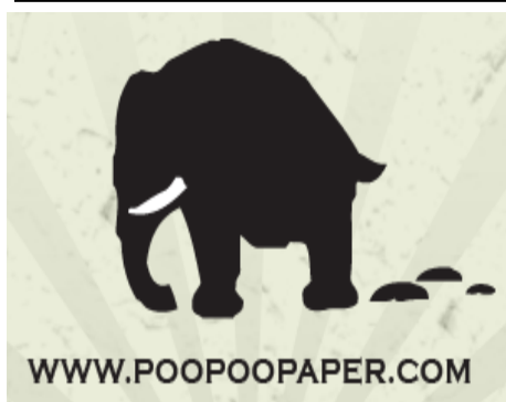
Elephant PooPoo Paper