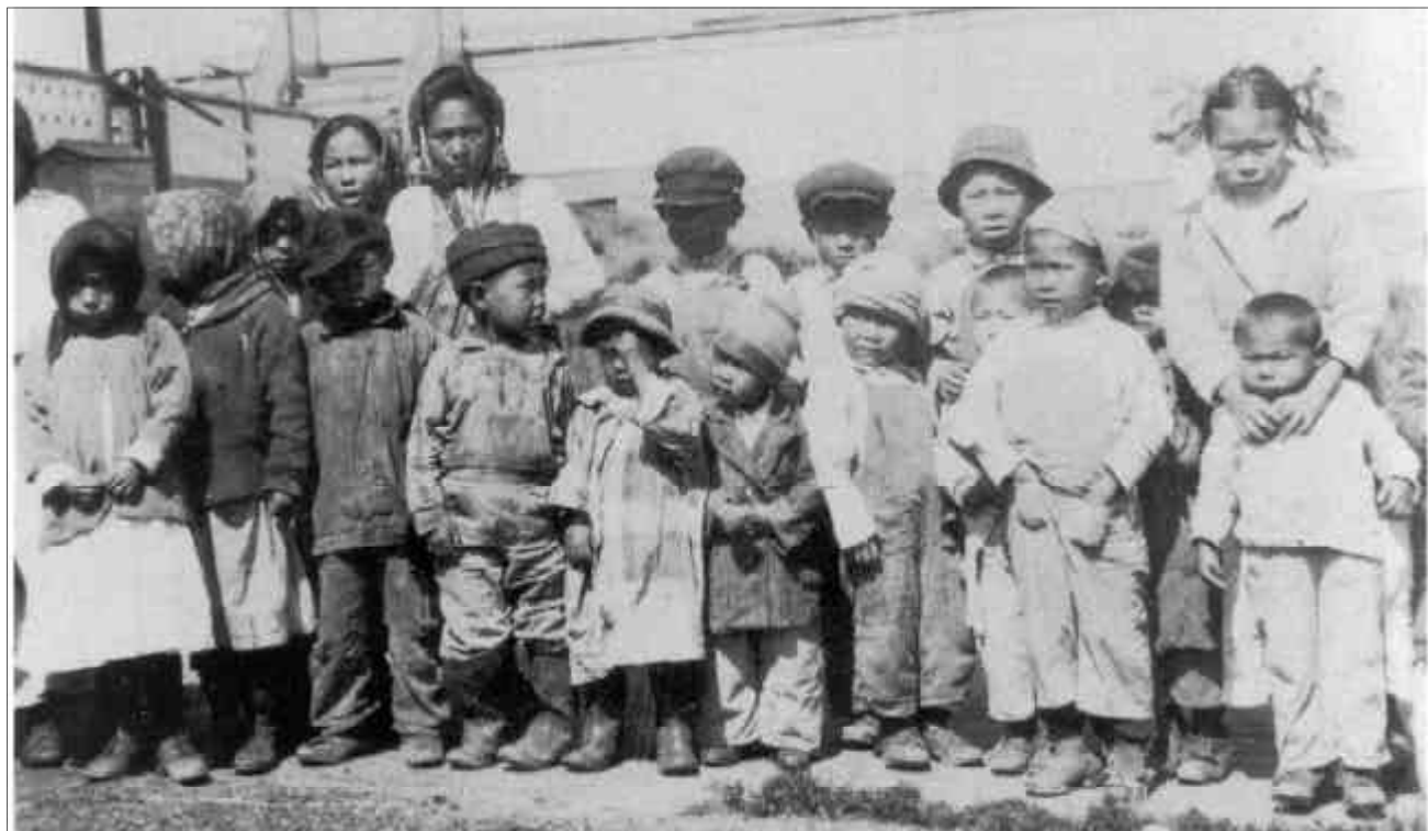
Figure 4: Native children of Naknek who were orphaned by the 1919 influenza epidemic, no names provided (Branson 1998, photograph # H-427).