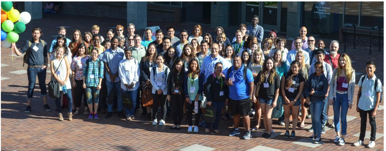
Portland Orientation 2015