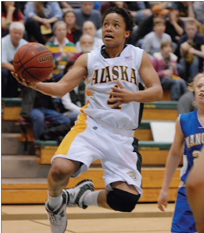
The 2008 women's and men's basketball teams set new records for collegiate play in Alaska.