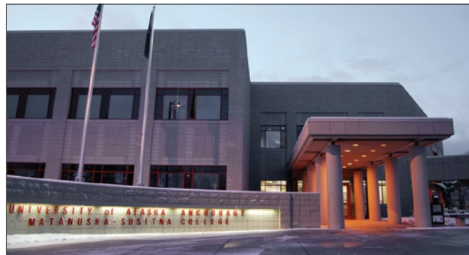
Mat-Su College, a valuable asset to the local community, just celebrated 50 years of providing excellent education in the Valley.

Prince William Sound Community College provides an important catalyst for the advancement of theatre in Alaska during the Last Frontier Theatre Conference in Valdez.