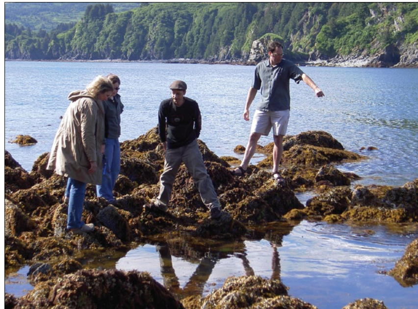
Kodiak College students observe the biodiversity of the tidal areas on Kodiak Island.