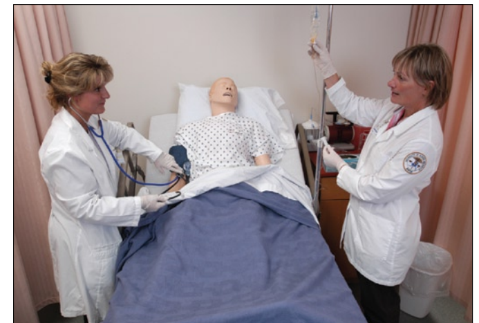
Kenai Peninsula College students learning bedside care of patients.